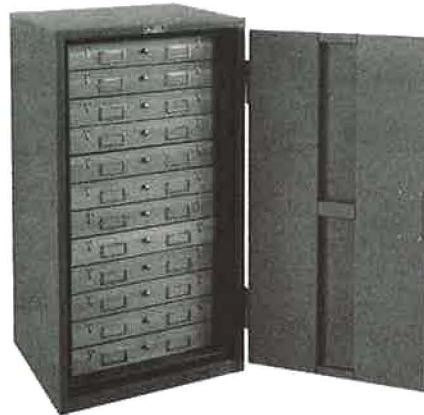
MODEL 401 with 12 #415 Cornell drawers

Dimensions Height 42 3/4" Width 23 3/16" Depth 20 1/32"