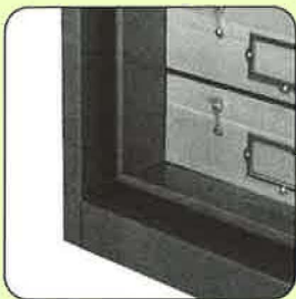
ELASTOMERIC DOOR SEAL • No adhesives