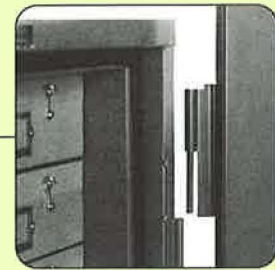
LIFT-OFF DOOR WITH SLIP TYPE HINGE A slip type, 13-gauge, safe type steel hinge assures lifetime service. Simply open the door, lift up, and the door is completely free; and, it is as easy to replace. When mass transfer of specimens is to take place, remove the door and you have continuous uninterrupted access to the cabinet's contents.